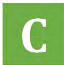
Child Abuse & Neglect